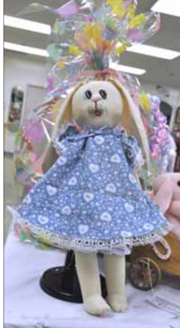
The "Dammit Doll" and the Easter Bunny are just a few of the many handmade items you can find in this unique shop!