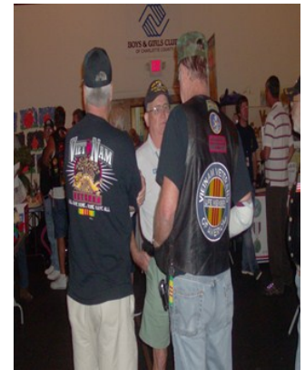
6th Annual Homeless Veteran Stand Down, 30 October 2010